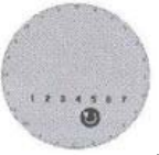
Timer Programme Screen

To alter Timer program steps - Re-Enter the above process, select your Day, follow as above and the "old" values will be over-written or "Rubbed out"