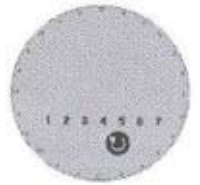
Timer Programme Screen