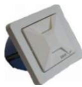
Sensor supplied with 01-140F1072-ASF