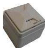
Sensor supplied with 01-140F1072-ASS