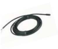
Sensor supplied with 01-140F1072

Sensor option supplied with the above Code Nos.