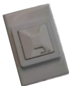
Sensor supplied with 01-140F1072-ANF